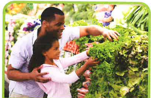
Buy only what you need. Eat what you buy.