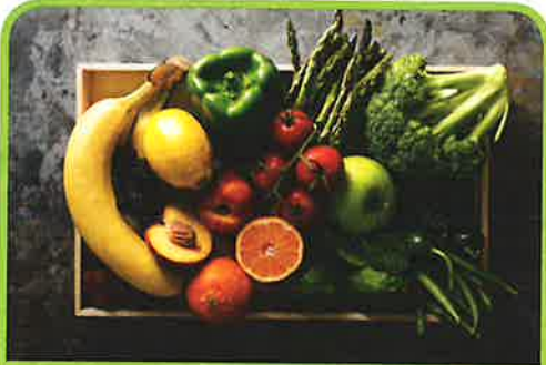
40% of food in the United States of America is thrown away.

Joseph's family lived when there was a famine. Today many of God's family live in places with famine. Let's figure out what we can do to help. Look at the photos. Read the facts. Which one tells us something we can do to help?