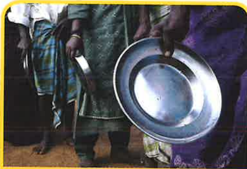
Wasted food could feed 25 million people.