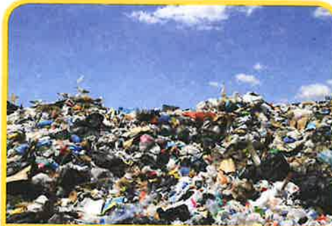
Food waste fills up the most space in landfills.